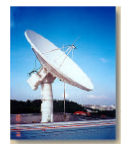
CRISP's 6-m X band antenna for MODIS data reception

Centre for Remote Imaging, Sensing and Processing, National University of Singapore